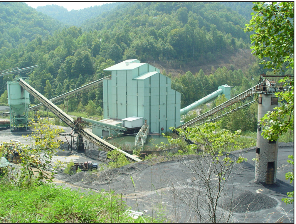
Among the many technological "fixes" that utilities are using to try to stave off global warming is "coal washing" to filter out impurities. Pictured here is a now-decommissioned coal washing facility located in Clay County, Eastern Kentucky.