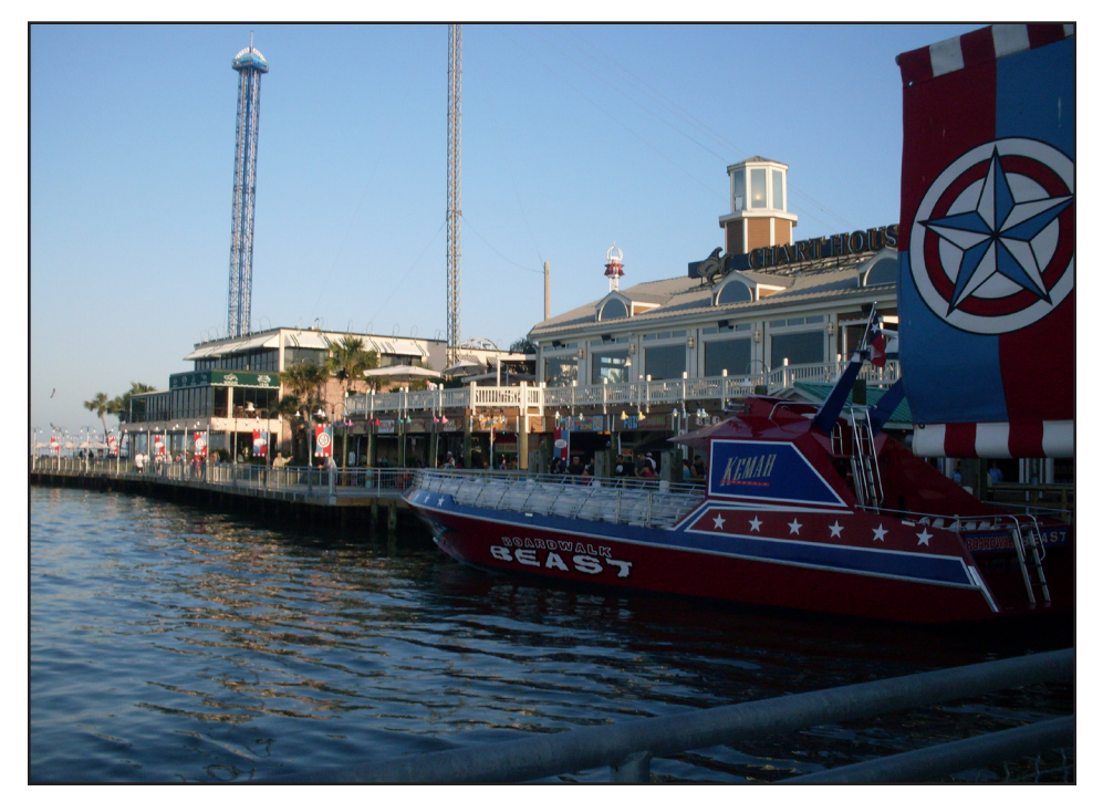
The fun is starting to return to the waterfront in Kemah. The Boardwalk complex, which sustained heavy damage from Hurricane Ike, opened its hotel, a few more restaurants and about 20 of its retail shops.

With the magnificent gulf coast view, free music and show, one can spend the day at Kemah without having to break the bank. It remains a serene getaway where kids can get wet in the Dancing Fountains and enjoy the Aquarium's splendor of brilliantly colored coral and fish.