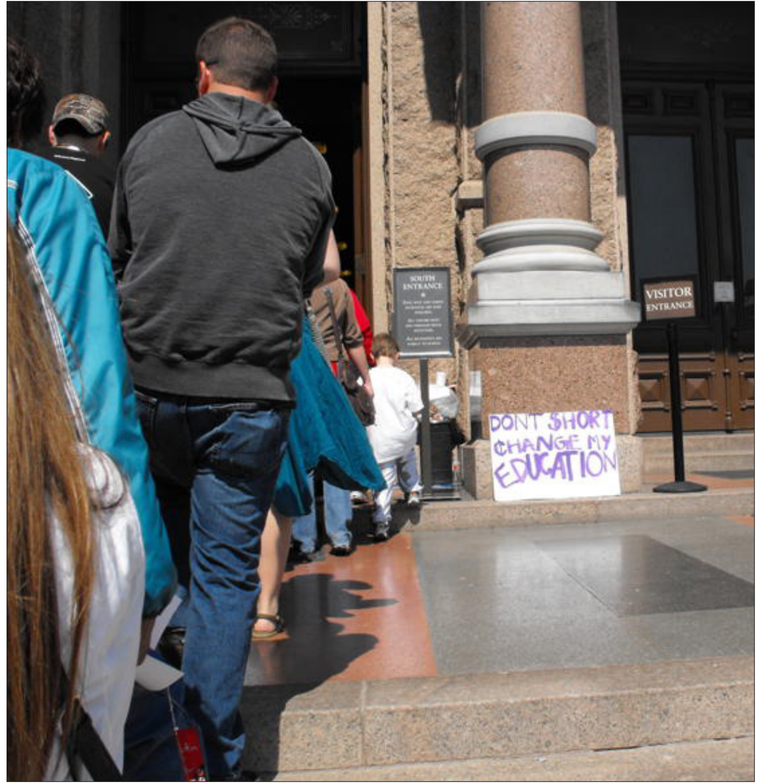
Members of SGA took a road trip to Austin to find out what students can do to fight budget cuts in higher education.

The 5th edition of Texas on the Brink, a report from the Texas Legislative Study Group, notes that our state "is dead last in the percentage of residents with their high school diploma and near last in SAT scores." Texas is 43rd of 50 in a country ranking for high school graduation rates, graduating only 62.6 percent of its students. Of that 62.6 percent graduating, only 55.4 percent of those students got to college, and even more disturbing, 50 percent of college freshmen are enrolled in remedial courses.