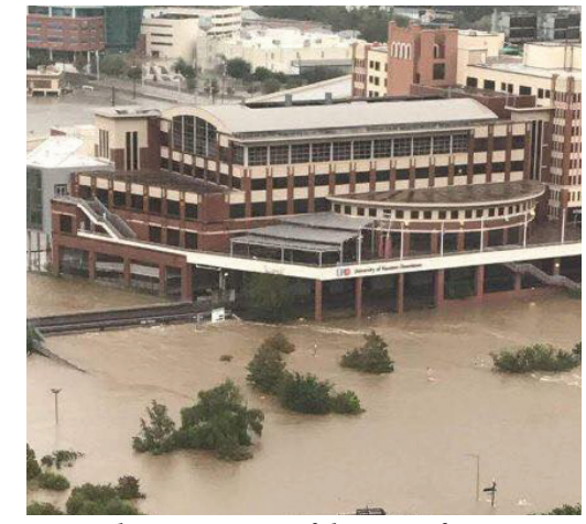
Harvey: The Road to Recovery Pg. 4-5