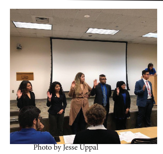
"Playing Politicians" Pg. 3