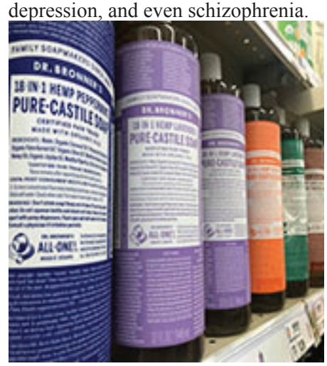
Hemp products at a Colorado Kroger.

spread of cancer cells, while CBD and THC can slow and even shrink tumors. Lastly, not only can marijuana aid ailments of the body, but it has also been known to benefit users' mental health. Medicinal marijuana has been shown to reduce the symptoms of anxiety disorders, PTSD,