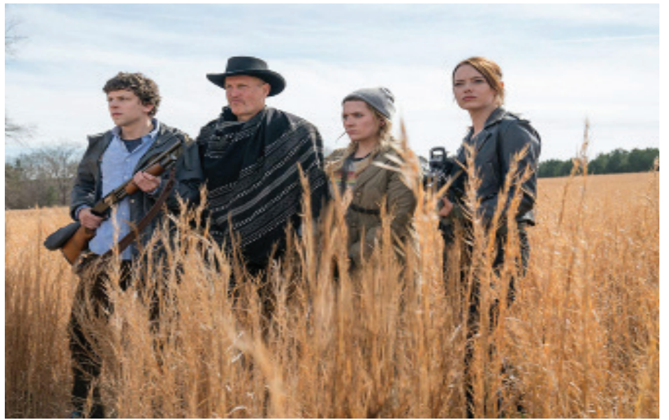
From left: Jesse Eisenberg, Woody Harrelson, Zoey Deutch and Emma Stone

Star Woody Harrelson (Tallahassee) spoke on