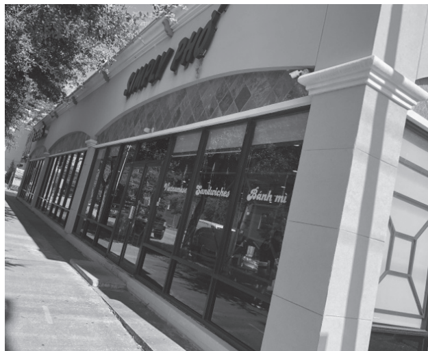
Simply Pho sits in a strip center in the middle of Downtown Houston. A hidden gem.

The atmosphere is what first catches your attention when walking into Simply Pho. While it still has a traditional feel to it, the entire space is moderinized at the same