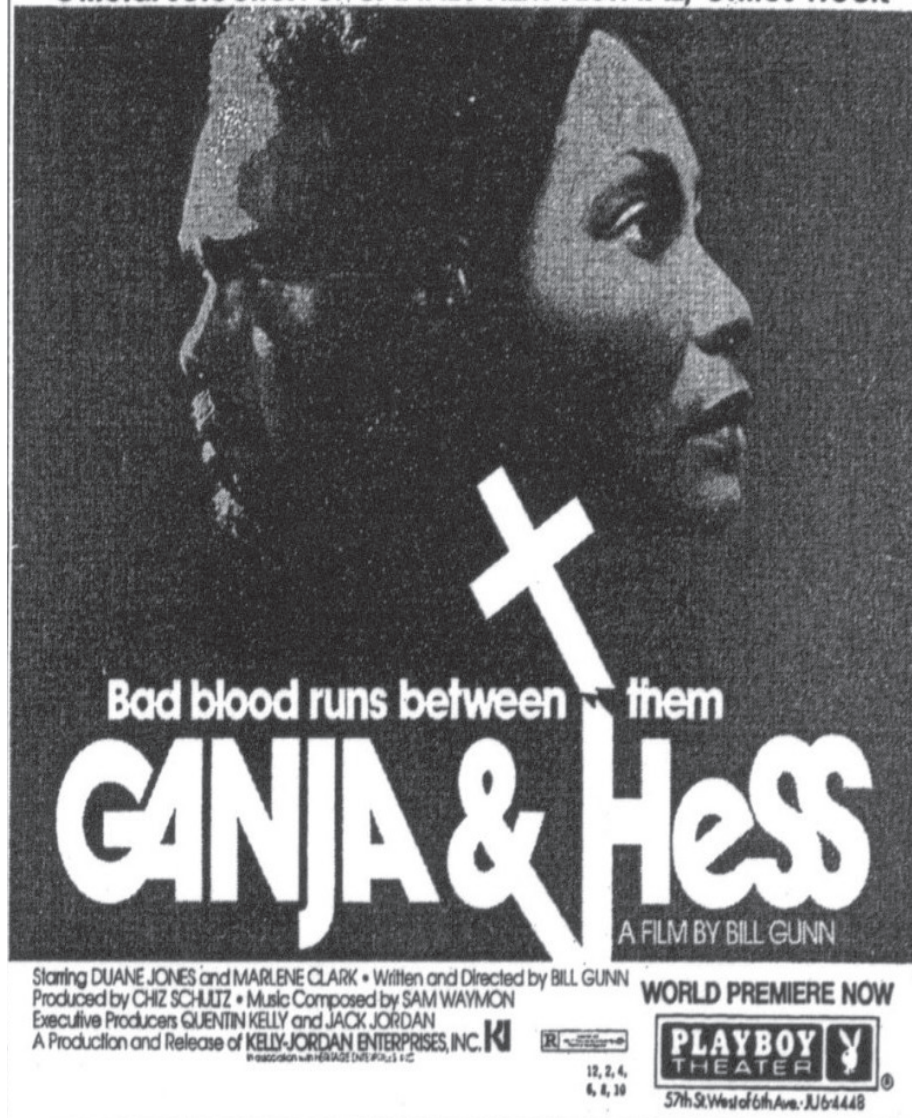
Movie poster of “Ganja and Hess” from 1973

Official selection of CANNES FILM FESTIVAL, “Critics Week”