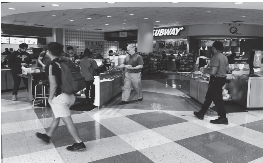
The Cafeteria area is one of the busiest spots on campus. With Gator Cash, it may soon become even busier.