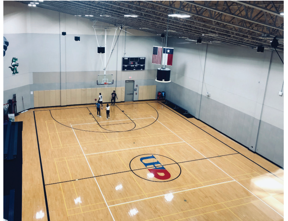
The basketball court inside the UHD student center is currently only used for recreational and club team purposes.

UHD has a similar opportunity upon them. They can provide an alternative to the University of Houston-- who has recently made a name for itself as a major D1 sports powerhouse -- and other Texas universities like TSU, Prairie View A&M