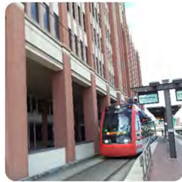
Redline METRORail stops at UHD in 2022.