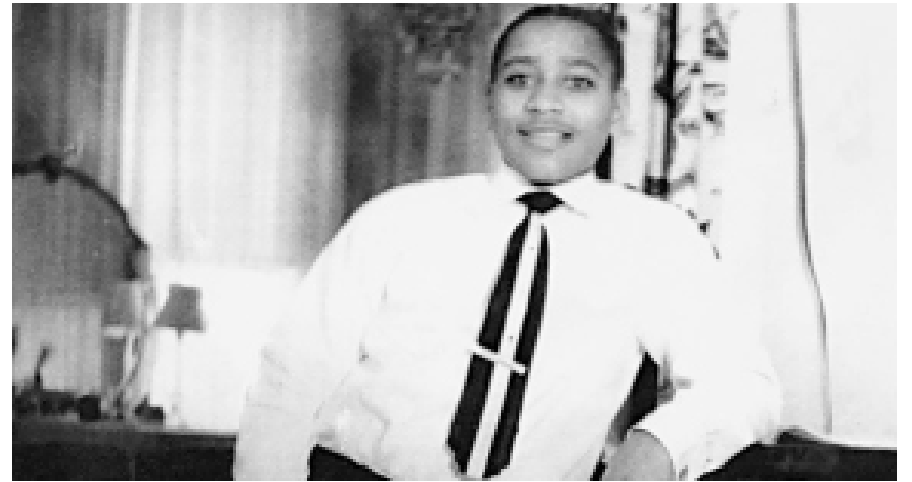
Emmet Till, 14, at his home in Chicago about 6 months before he was killed while visiting family out of state.

However, there have been around 15,000 troops sent to bump up security for NATO's eastern flank over the past few months.