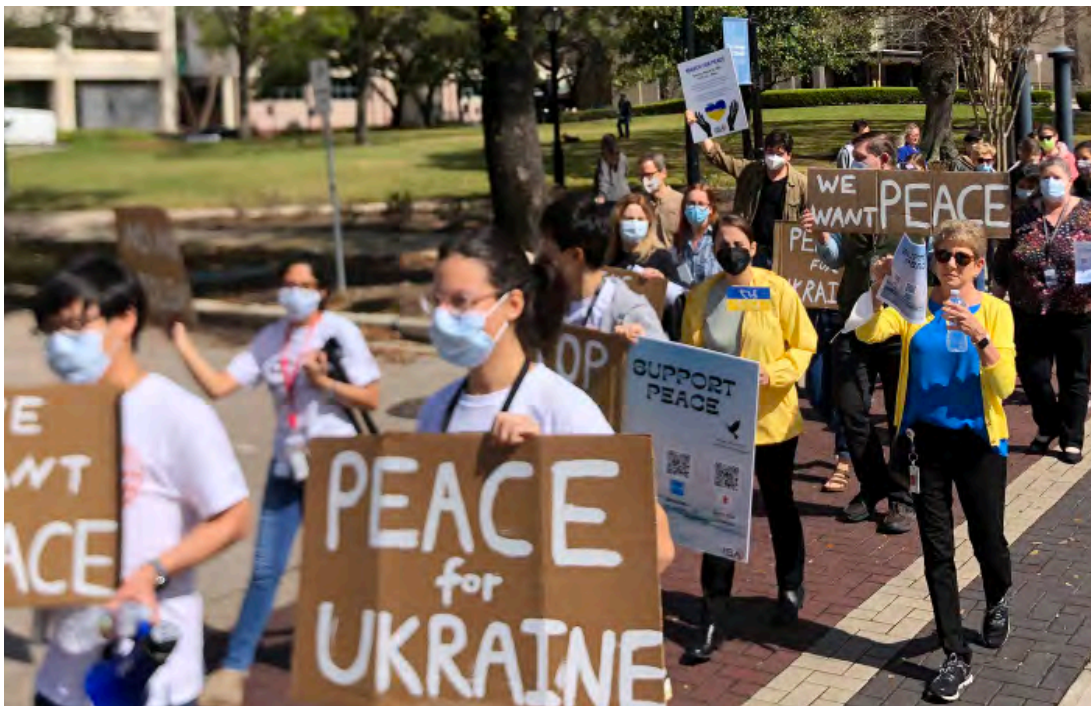
The crowd holds signs and marches for peace in Ukraine in the Texas Medical Center on March 22.