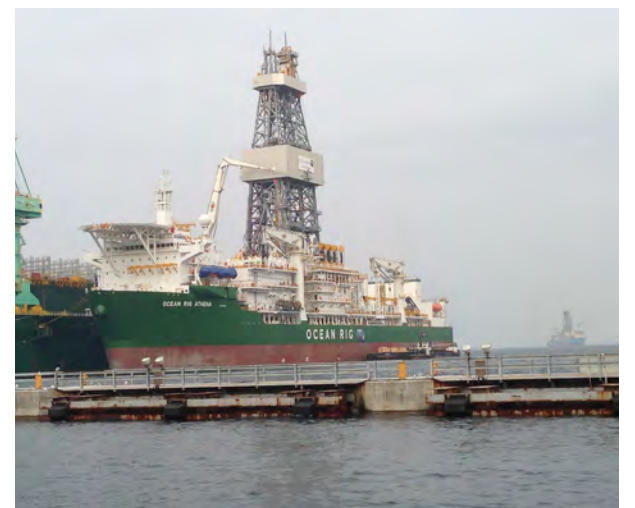
Ocean Rig Athena off the coast of Busan, South Korea.

Ukrainian President Volodymyr Zelenskyy asked Congress to stress the importance of U.S. businesses still operating in Russia to leave by stating that the Russian market is "flooded with our blood."