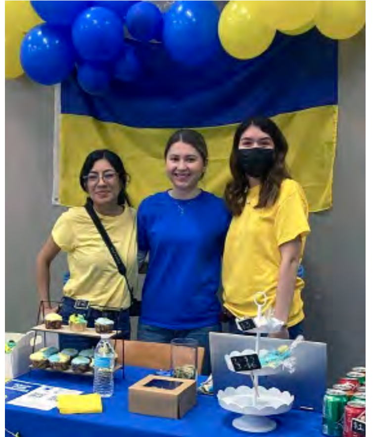
Students from the International Business Association organized a bake sale to raise funds for Ukraine.

"Living in the fourth largest city of the country, diversity is everywhere," the organization stated. "As the International Business Association of UHD, we push to bring more attention to international issues happening in the world around us."