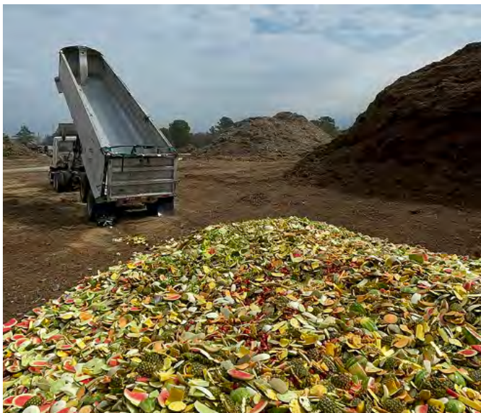
A truck unloads pre-consumer scraps of fruits and vegetables at The Ground Up facility for composting.

For Gators wanting to learn more about gardening and composting, the Garden and Compost Club President Diana Ambrosio said the club will post future events on @uhdgardencompost on Instagram.