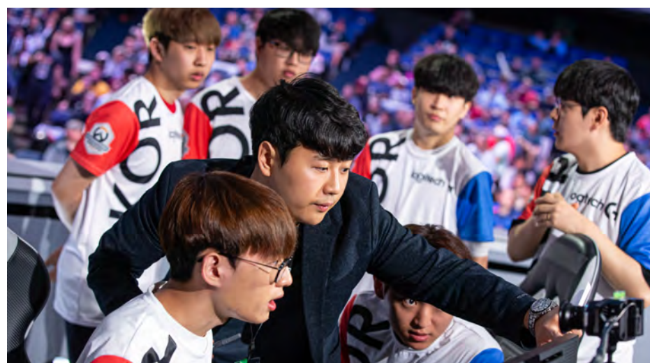
South Korean team at the Overwatch World Cup.

Meaning the planned start of May 5 will be the latest for the league yet, and it will fall right in line with rival game Counter