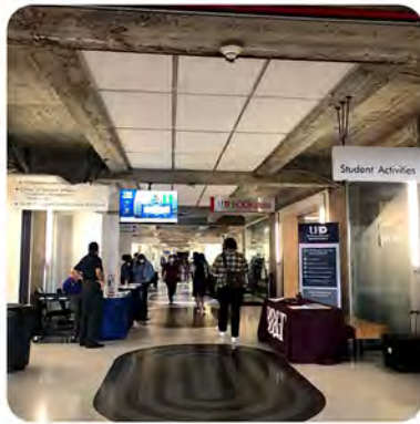
Third floor hallway of the One Main Building in 2022.