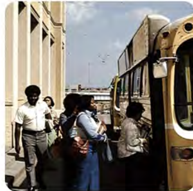
Students onboard the bus outside the One Main Building in the 1970s.