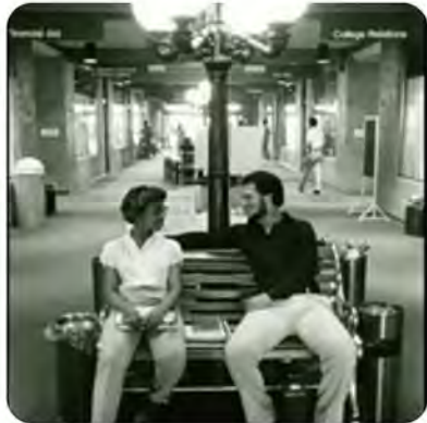
Students taking a break in between classes in the third floor hallway.

UHD is more than just an institution of education, but also a part of history, which continues to develop and pave the way for our future and its leaders in the fields of science, technology, engineers, and mathematics, respectively.