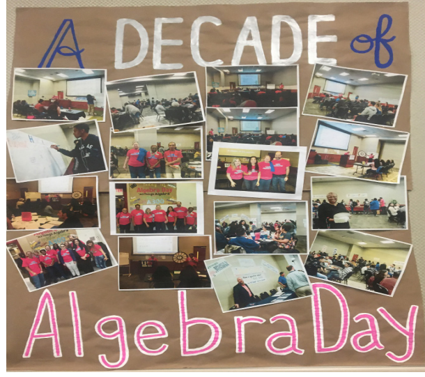
Bulletin board memorializes 10th anniversay of Algebra Day at UHD on Nov. 9.