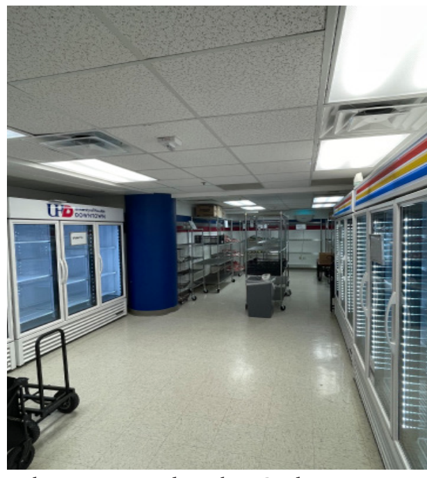
Empty shelves and refrigerators, a fairly common sight at UHD Food Market.

through your week, but it's also for those who don't want to spend $12 on meal they can go to the market and... get the same items and bring it back."