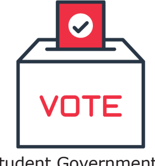
Student Government 8 6 Special Elections