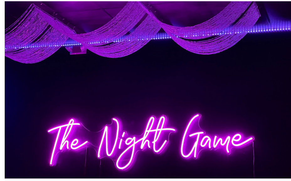
A large The Night Game neon sign inside the main parlor.