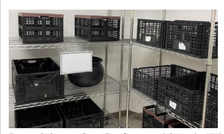
Empty shelves on Oct. 17, a frequent sight at the UHD