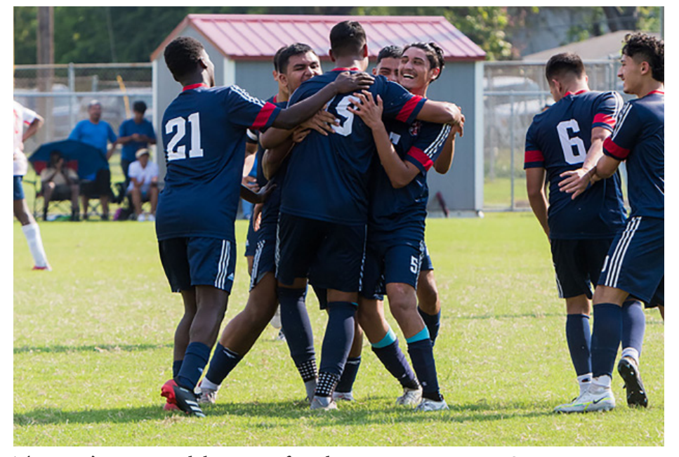
The men's soccer celebrating after their 2-1 win against Sam Houston State University.