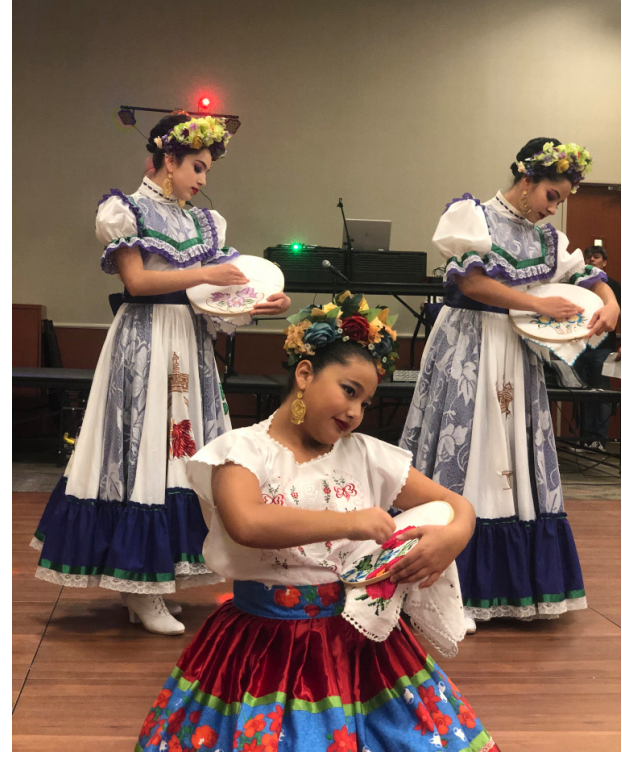
Folkloric dancers feature traditional Mexican attire and dance.

Attendees also got a chance to win prizes in a contest. For example, participants rapped to Daddy Yankee's "Que