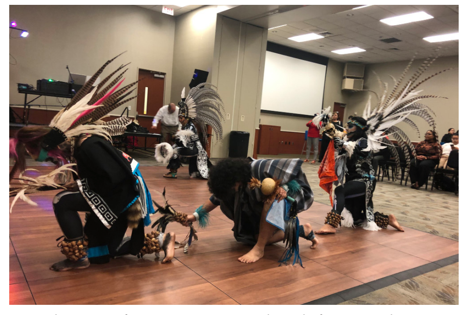
Guest dancers perform an ancient Aztec dance before a crowd on Oct. 19 during LatinFest.