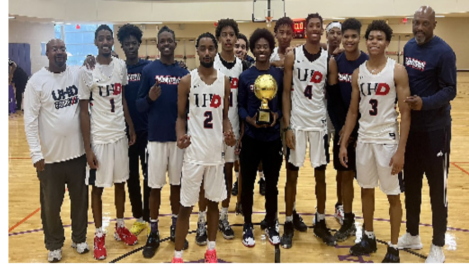
The UHD Basketball team with their trophy after winning the Houston Club Sports Conference.

Although the basketball season is over for both the men