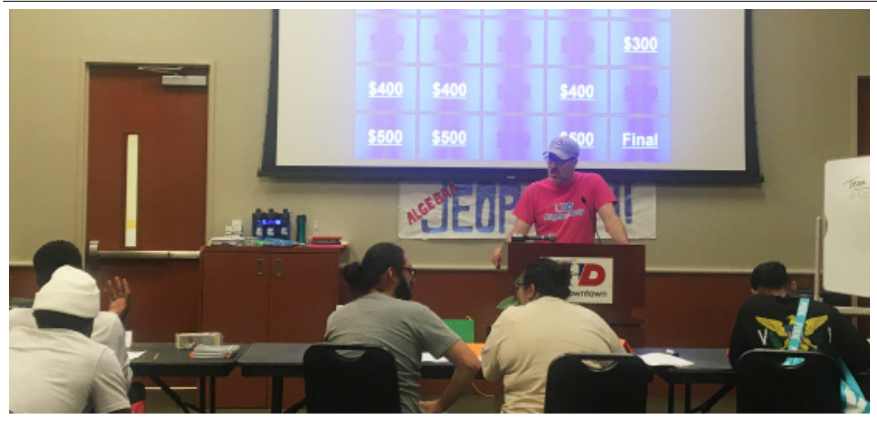
UHD students play Algebra jeopardy during Algebra Day on Nov. 9.