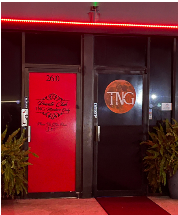
The front entrance to TNG that indicates the exclusivity of the club.

My genuine curiosity led me to an accepting and diverse community that opened my eyes to a different way of life and the benefits that follow.