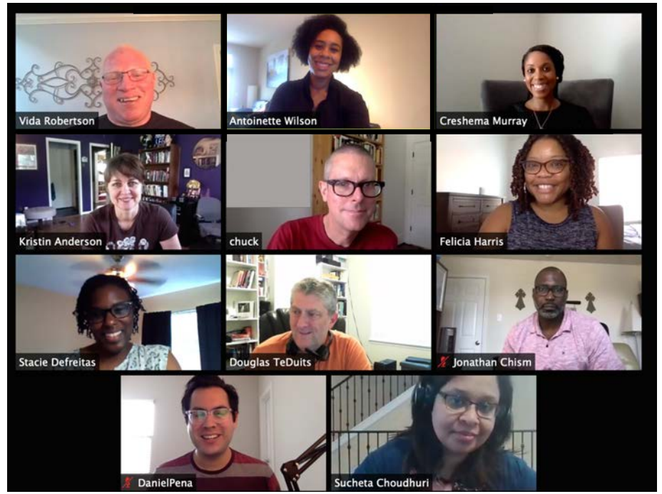
CCRS Fellows, May 2020

ourselves, our communities, and our interrelatedness, we can thrive together. CCRS is here for you.