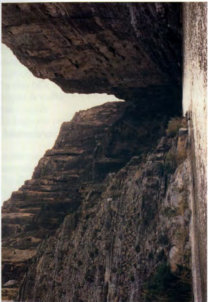
Santa Elena Canyon