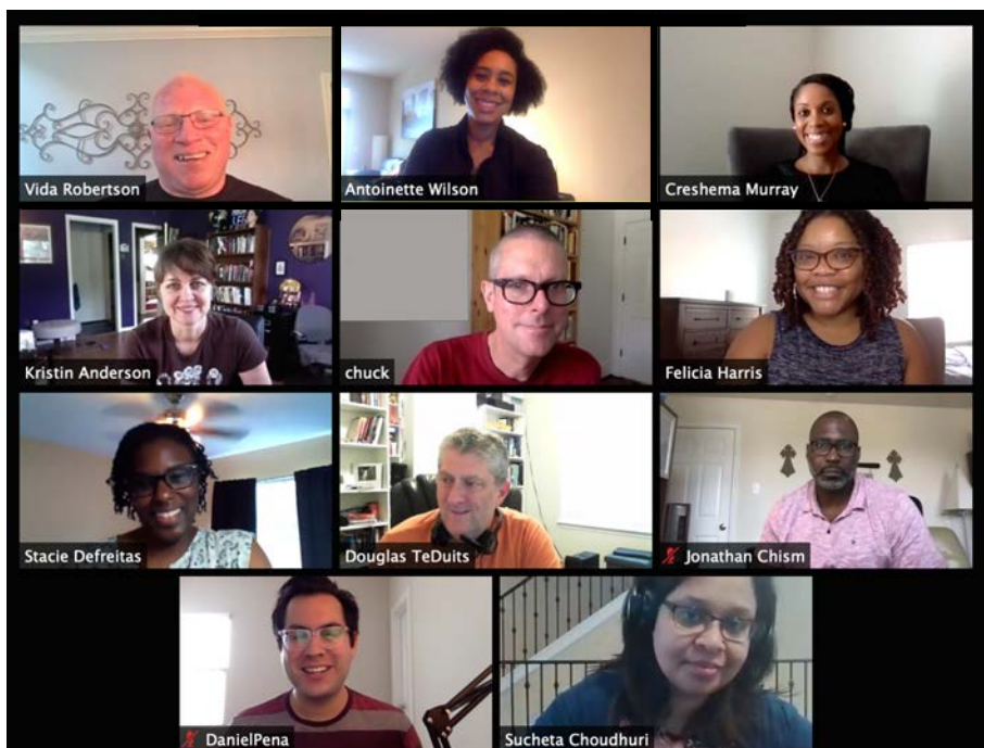
CCRS Fellows, May 2020