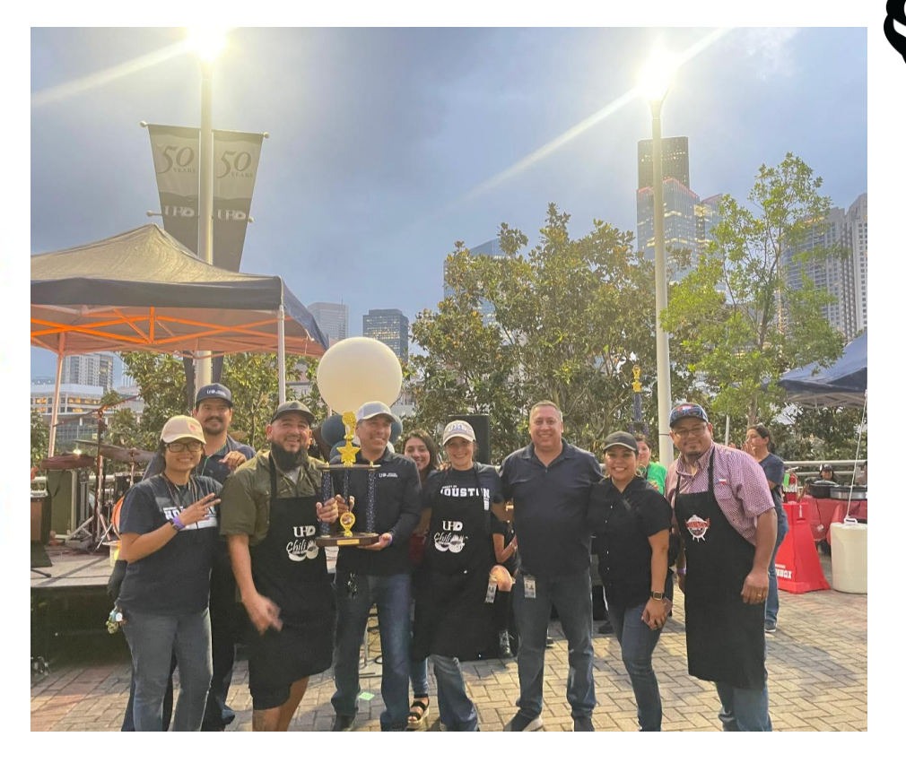
VOTED BEST CHILI 1ST PLACE: GATOR BAYOU COOKERS

VOTED BEST CHILI 2ND PLACE: DIA DE LOS GATORS